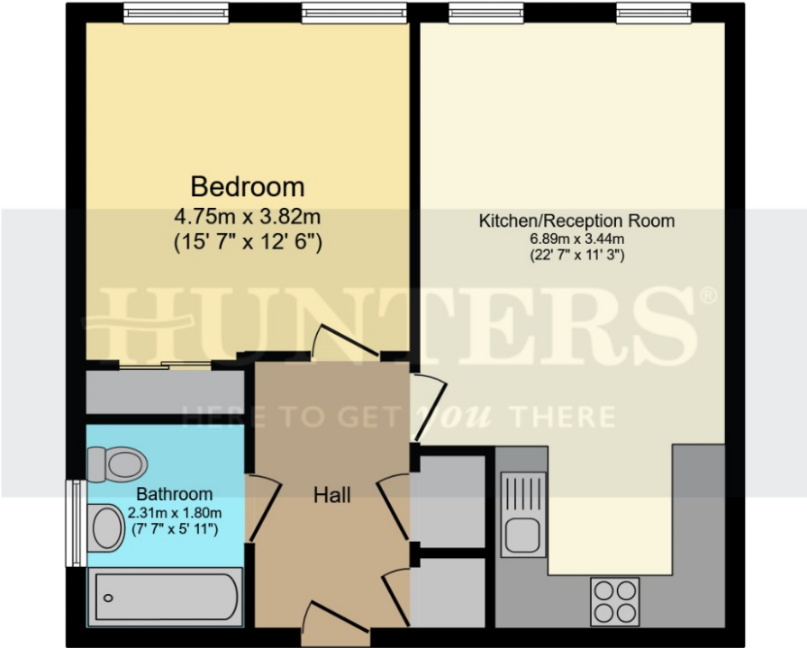
Floor Plan Floor area 49.3 sq.m. (531 sq.ft.)

124, Eastcroft House, 86 Northolt Road, Harrow, HA2 0ES, GB